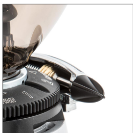
Stepless adjustment system